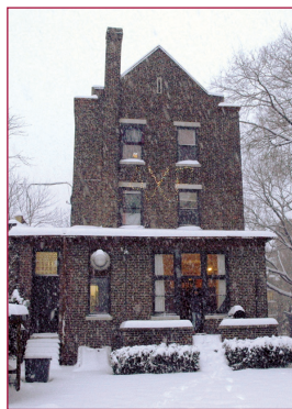
The Phi Phi house turns 100 in 2017!

In the meantime, we have immediate needs to repair the house floors and banisters and roof, which together will cost between $10,000 and $20,000. The funds need to be