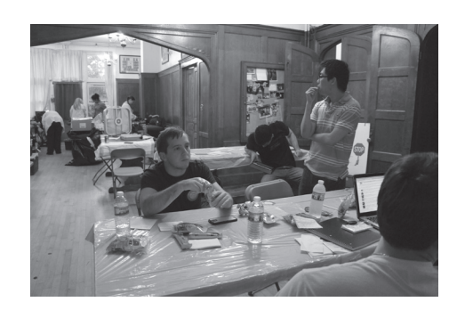
A blood drive was held on the first floor of the chapter hall in October.